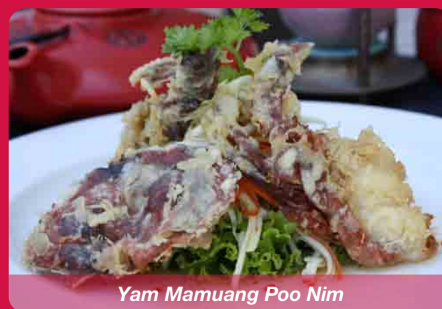
Yam Mamuang Poo Nim