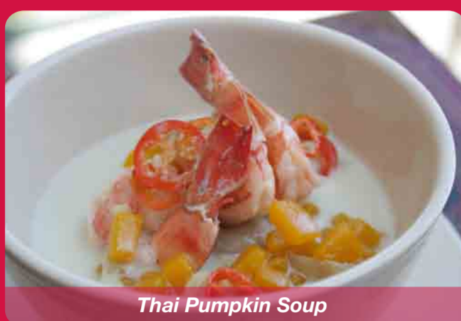
Thai Pumpkin Soup