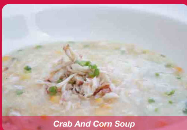
Crab And Corn Soup