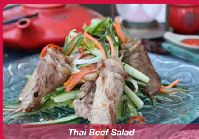
Thai Beef Salad