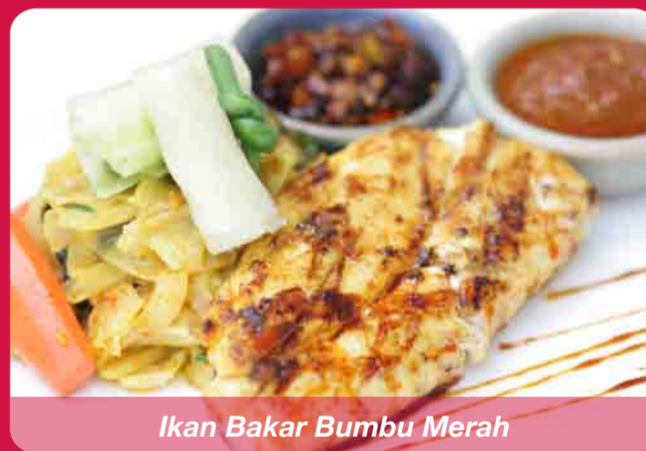
Ikan Bakar Bumbu Merah