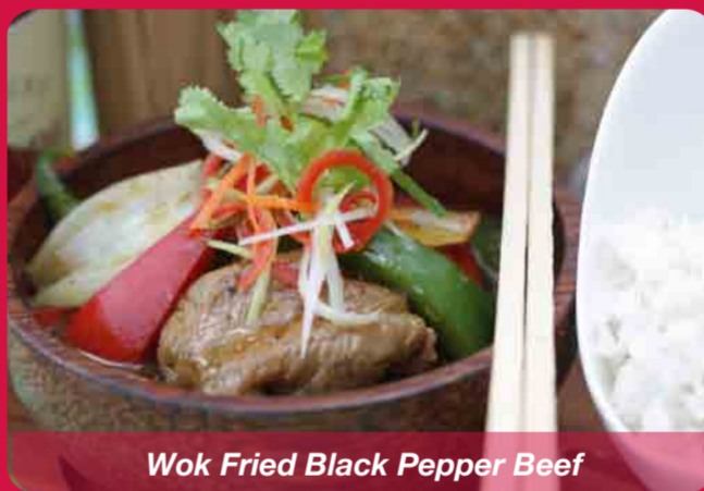
Wok Fried Black Pepper Beef