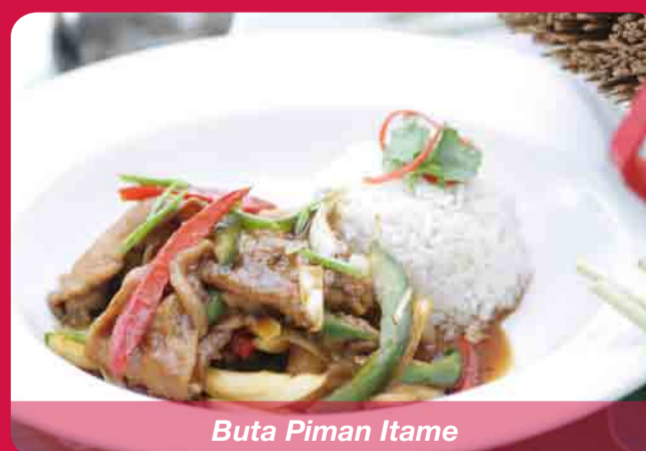
Buta Piman Itame