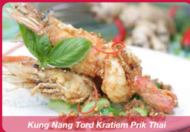
Kung Nang Tord Kratiem Prik Thai