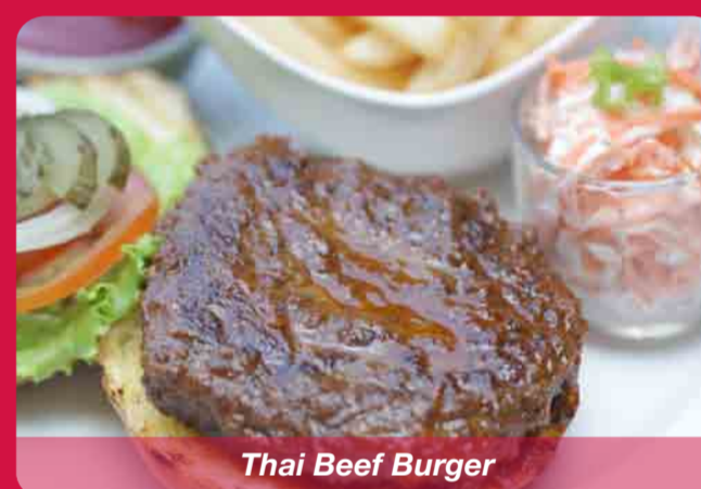
Thai Beef Burger