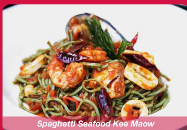
Spaghetti Seafood Kee Maow