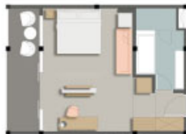
Approx. Deluxe Room Size 36 m 2